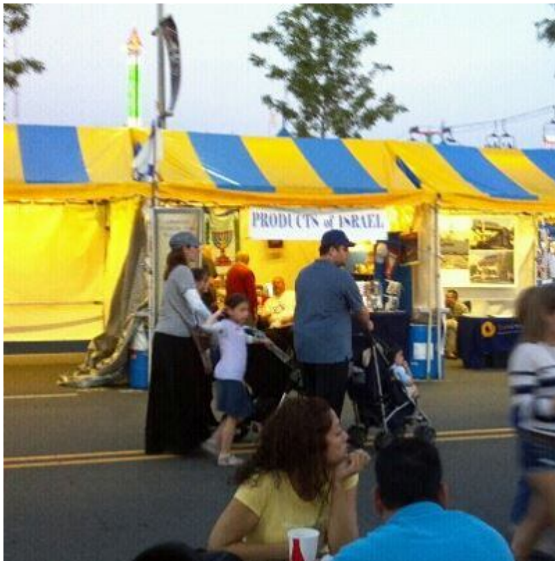
New Jersey State Fair

In between working with Rock of Israel, I visited the GROUP from New York who found our website and distribute our " Jesus Loves You " t-shirts and Gospel tracts. We visited Orthodox Jewish areas and challenged people with our t-shirts and distributed some tracts. I visited FAMILY , a High School Classmate's BAND and several Jewish vendors in New York City and Brooklyn who were most challenged by my t-shirt! I went to a new wholesale contact in the Borough Park (Ultra Orthodox) neighborhood of Brooklyn. When I went up to the showroom, several Ultra Orthodox were quite surprised by my t-shirt and their mouths literally fell open!